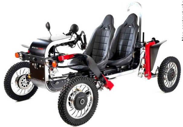
Non contractual photo